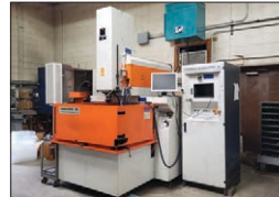
Charmilles Technologies CNC EDM