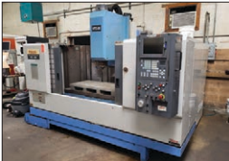
Mazak CNC Vertical Machining Center