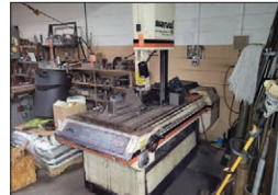
Marvel/Armstrong-Blum Vert. Band Saw