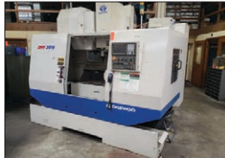
Daewoo CNC Vertical Machining Center