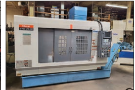
Mazak CNC Vertical Machining Center