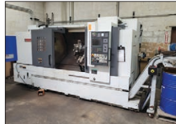
Mori Seiki CNC Turning Center