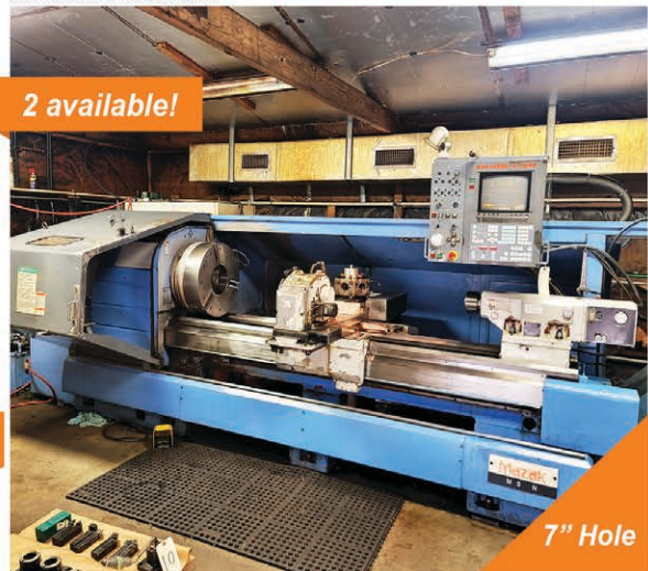
LOT 112 Mazak M5 CNC Lathe with Mazatrol T Plus