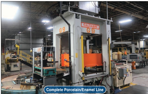
Complete Porcelain/Enamel Line

ASSET LOCATION: 2009 Mirro Drive, Manitowoc, WI 54220