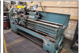
Victor Gap Bed Lathe

Call us today for a confidential consultation at 847.272.0440 or email: charlie@winternitz.com