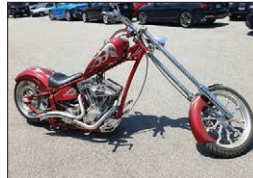
Custom Chopper Motorcycle