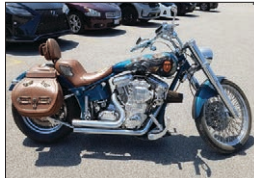
Custom Blown Softail Motorcycle