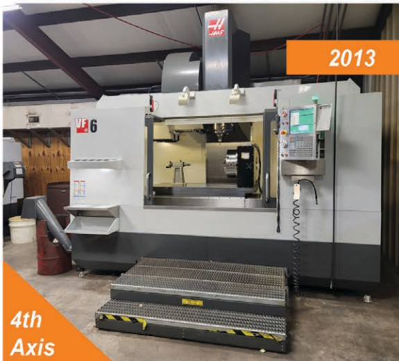
LOT 91 Haas VF-6/50 Vertical Machining Center

Featured Lathes, Mills &amp; Turning Centers from HAAS, DOOSAN &amp; MAZAK