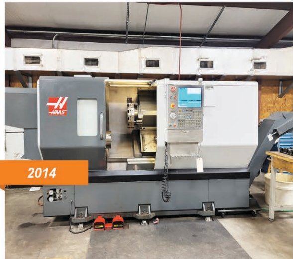
LOT 102 Haas ST-30 CNC Lathe