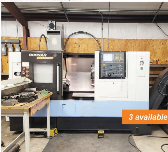
LOT 106 Doosan Puma 300 Turning Center Machine