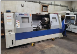
Daewoo Puma CNC Turning Center